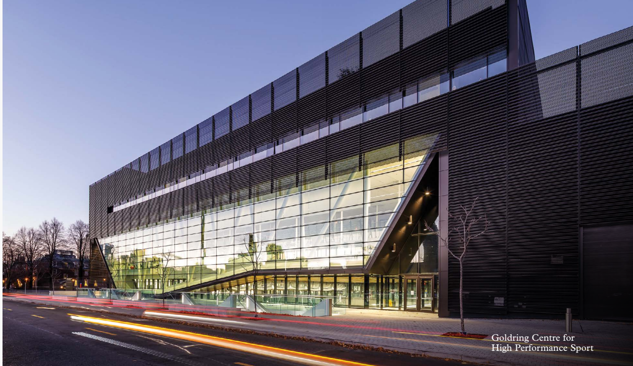
Goldring Centre for High Performance Sport